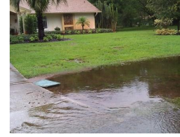
Pepperell floods during Tropical Storm Debby