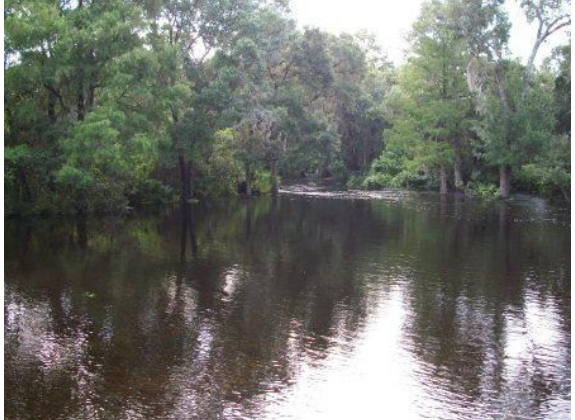
Overview Resident's back yard after Tropical Storm Debby

Management by completing the online services request in the PUBLIC WORKS section of the CUSTOMER SERVICE CEN-Once your service center item has been submitted, a Pasco County Storm Water employee will visit your site and make a determination if the County